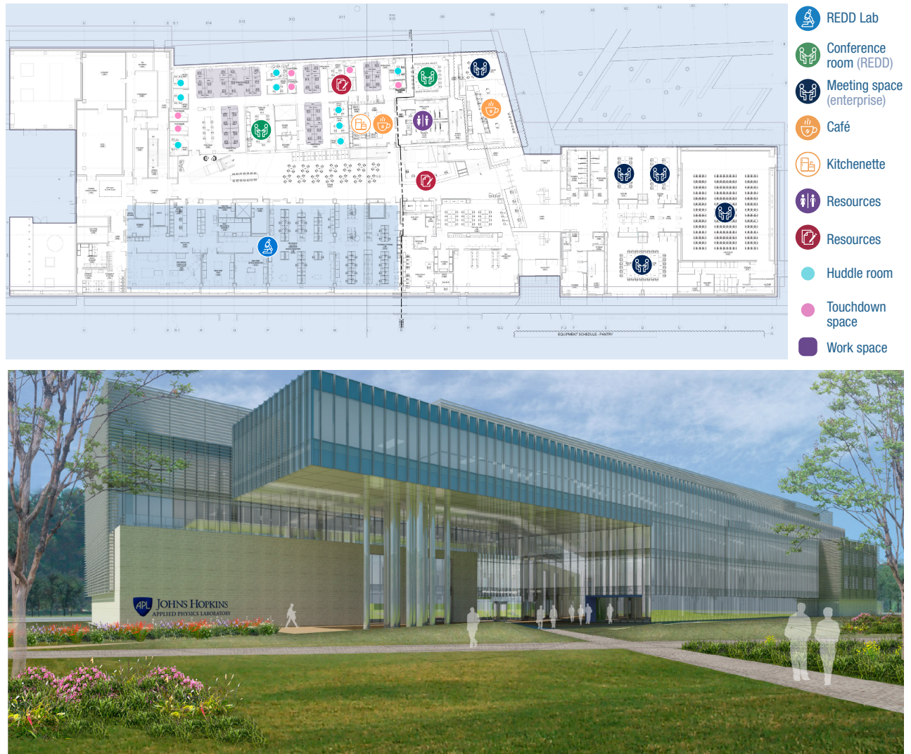
Figure 2. Updated B201 design. The updated design reflects a modern integrated approach, with common areas for multidisciplinary collaboration and innovation. Top, The updated floor plan for the first floor. Bottom, The updated rendering of the building exterior.

much larger building with a much larger budget. The B201 team spent nearly all of 2017 working out the details, often in the war room. The result is a building, now under construction, with great promise. Ground was broken in October 2017, and occupancy is slated for March of 2021.