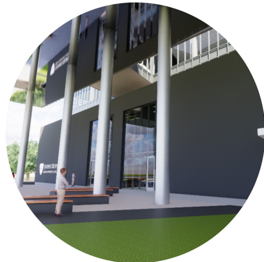
Figure 3. Side-by-side comparisons. The square images show the building under construction and the circular images show the same perspective in VR. Shown are the north entrance (left) and under the north cantilever (right).