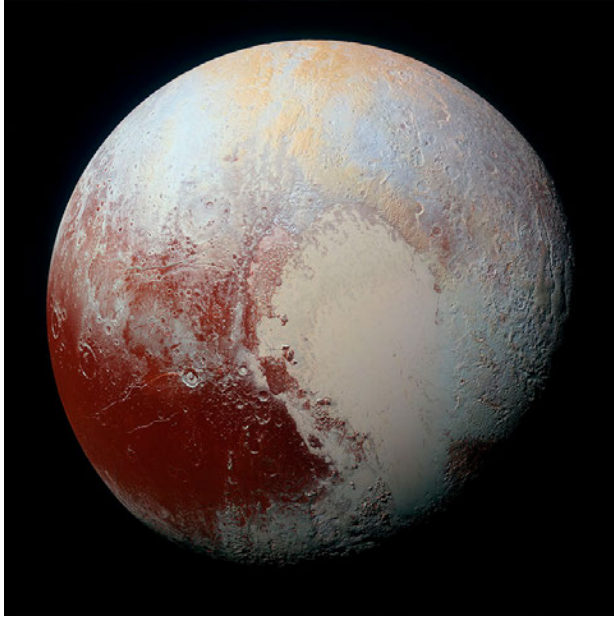
This high-resolution, color-enhanced image of Pluto was captured by the New Horizons spacecraft, which was designed, built, and operated by APL for NASA. It made the historic flyby of Pluto on July 14, 2015.

did APL remove all doubt, we charted a new path for the nation in space exploration. Landing the NEAR spacecraft on the asteroid Eros at the end of the mission, which had not been part of the original plan, and continuing to return science data for a period of time while on the surface of Eros was just an extra benefit to the international planetary science community.