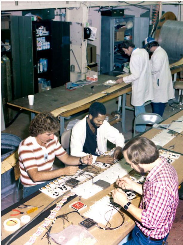
APL staff members assembling and testing towed arrays.

Successfully detecting submarines at sea entailed solving numerous scientific and engineering problems and developing towed arrays of sensors that could be deployed reliably to detect and localize undersea acoustic signals from great distances. Expertise from many