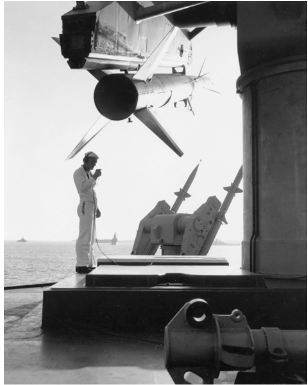
A sailor aboard USS Boston (CAG 1) stands by the missile-loading hatch as a Terrier launcher slews into the sun to point its missiles skyward.

The proximity fuze was lauded as one of the three most significant technological advances of World War II, along with the atomic bomb and radar.