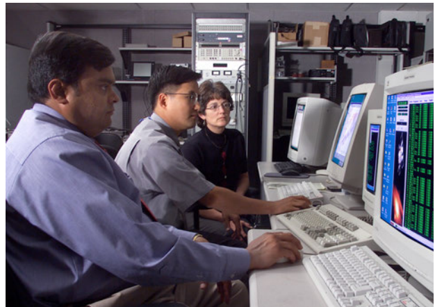
APL's SATRACK facility in 2002. The facility uses satellite-based test and evaluation data to validate and monitor guidance error modeling for the Trident missile.

The trusted service that was so essential for SATRACK continues to underpin our work today, especially as we support critical new initiatives with, for example, the nation's special operations forces and the intelligence community, and it will underpin our work long into the future.