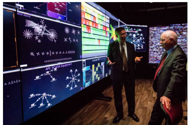
A congressional tour with Senator Ben Cardin of the unique capabilities of APL's LIVE Lab, a facility that helps researchers develop solutions to continually evolving cyber threats.

And working with our colleagues at Johns Hopkins Medicine, we are making deep contributions to restore capacity to critically injured service members, reduce preventable harm, and dramatically improve health around