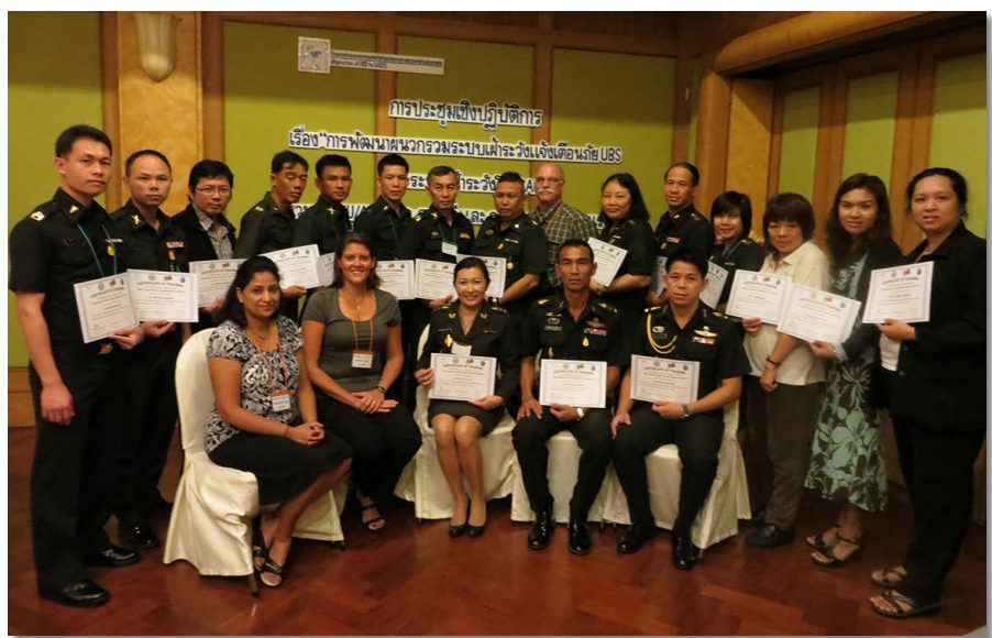
Figure 3. APL team members and members of the Royal Thai Army after training in Thailand.

The APL team provides post-installation support and troubleshooting as needed to ensure the system is operating as expected. This phase typically lasts throughout the pilot process. Communication occurs via e-mail or scheduled conference calls. The post-installation phase