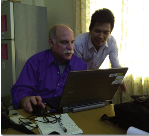
Figure 4. An APL team member implements SAGES in Cambodia.

is vitally important because this is when the local stakeholders take ownership of the system. The system will not succeed in the long term without local ownership. During this phase, the APL team elicits feedback from end users regarding various aspects of the SAGES tools, such as usability, feature gaps, and ease of administration. The feedback informs future development of the SAGES tools, which can be used in the current implementation as well as future implementations.