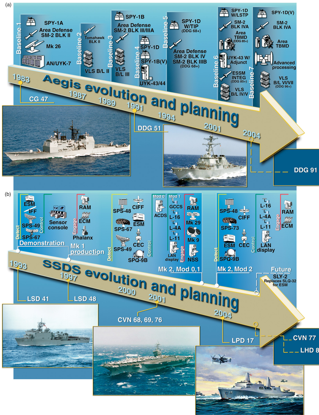
Figure 2. Evolution and planning of (a) Aegis and (b) the Ship Self-Defense System.

the impact of the environment on radar and missile performance. Sylvester et al. note that the combat system must be adjusted to the local environment to optimize missile performance. The equipment and computer programs developed by APL and how they function as part of the combat system are also briefly discussed.