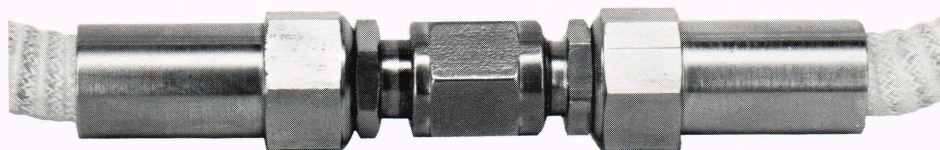
Fig. 1—Exterior view of coupling shown connecting two separate sections of flexible hose.

A cylindrical metallic "bullet" secured to the end of a threaded rod or mandrel was inserted into the free end of one section of hose, the bullet having a sliding fit with the internal diameter of the hose and an interference fit with the reduced