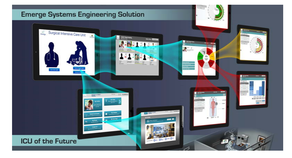
Figure 4. Project Emerge system concept. The system centers on a tablet application that displays integrated data from the various information systems and patient monitoring equipment used in an intensive care unit (ICU). The application's "harms monitor" seeks to reduce the occurrence of seven common preventable harms facing ICU patients by tracking whether preventative measures have been taken.

reports in the early 2000s highlighted the imperative to apply engineering principles to health care systems, more than 10 years later, deaths in the United States due to preventable medical errors were still estimated to be over 250,000.24 In 2012, a partnership between APL and JHM's Armstrong Institute for Patient Safety and Quality focused on demonstrating the ability to apply systems engineering in a health care setting to reduce preventable medical errors. Project Emerge (Figure 4), funded by the Gordon and Betty Moore Foundation, highlighted the effectiveness of integrating data and systems in an intensive care