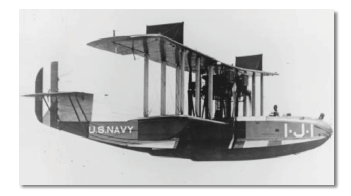
Figure 4. On 15 September 1924, for the first time in history, a radio-controlled Curtiss F-5L was flown remotely through all phases of flight.

that equipment for radio control of an F-5L aircraft had been demonstrated up to a range of 10 miles and that it believed that radio control of an aircraft during landing and takeoff was feasible.<sup>7</sup> Tests continued, and on 15 September 1924, two test flights were made in which both the automatic stabilization and radio-control systems functioned flawlessly. A third flight was conducted that same day and, for the first time in history, a radio-