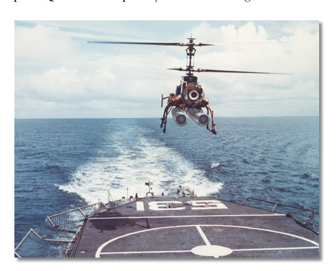
Figure 11. A QH-50C DASH drone is recovered aboard USS Hazelwood (DD-531).

In the mid- to late 1950s, the United States needed a way to counter the threat of a rapidly growing Soviet submarine force. The Navy's DASH (QH-50) was the first operational unmanned helicopter designed for a combat role. In 1960, a QH-50 (powered by a Gyrodyne-Porsche engine) made its maiden flight at Patuxent River Naval Air Station in Maryland. During the 1960s, almost 800 QH-50s were built. <sup>29</sup> The DASH unmanned helicopters were flown remotely from a destroyer's deck and carried Mk-44 homing torpedoes or Mark 17 nuclear depth charges. They could also be controlled from manned aircraft or ground vehicles and could drop sonobuoys and flares, perform rescues, transport cargo, illuminate targets, deploy smoke screens, perform surveillance, and target spot for naval fire support. QH-50s subsequently carried a mini-gun and even