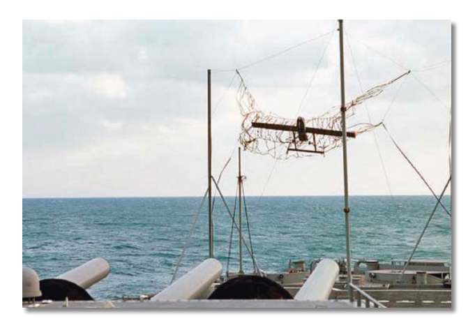
Figure 14. A Pioneer UAV is recovered aboard an lowa -class battleship.

So, with drastic budget cuts, UAV development basically ceased for about a decade.