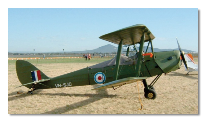
Figure 6. The de Havilland Tiger Moth was modified to provide radio-controlled aerial target services to the Royal Navy.

it sustained two hits on the forecastle, causing little damage. Ex-Iowa would continue to serve the Navy as a radio-controlled target vessel, ultimately being sunk by the USS Mississippi (BB-41) in March 1923 in the Gulf of Panama. History was made that June when the German battleship ex-SMS Ostfriesland and the U.S. pre-Dreadnought battleship ex-USS Alabama (BB-8) were sunk by aircraft. Mitchell had ordered his pilots to avoid direct hits in favor of near misses in the hopes that the explosive forces and water pressure would weaken the hull, resulting in a catastrophic failure. 11 A board of naval officers who had observed the tests concluded that the "airplane is a powerful weapon of offense." 12 Moffett was forced to admit that "the bombing experiments during June and July . . . demonstrate beyond question that unhampered aircraft suitably armed can sink any type of ship."13