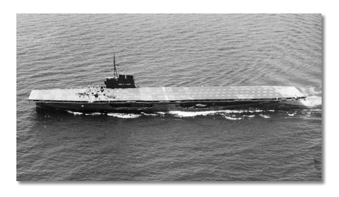
Figure 9. USS Sable (IX-81), one of two side-wheel aircraft carriers used for training on the Great Lakes, was used in operational tests of the TDR-1.

In May 1942, after viewing films of successful tests conducted in the Narragansett and Chesapeake Bays, CNO Admiral Ernest King directed that a program be initiated to expedite the development and use of target drones as guided missiles in combat. Dubbed "Project Option," under the command of Commodore Oscar Smith, drones produced by the Interstate Aircraft and Engineering Corporation were designated TDR-1 and outfitted with television guidance systems and controlled from a trailing TBF Avenger. They could be armed with either a torpedo or a 2000-pound bomb.<sup>4, 14–18</sup>