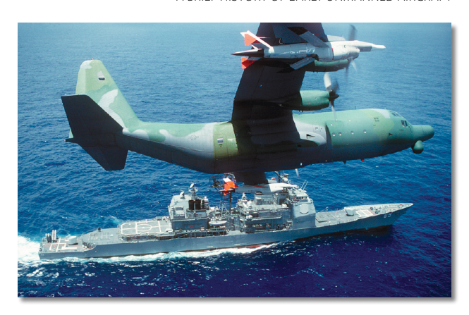
Figure 12. Still used today, two Teledyne-Ryan AQM-34 drones are carried on the wings of a DC-130 Hercules aircraft.

dropped an assortment of bomblets in various covert missions over Vietnam in the late 1960s. In 1970, the DASH program was canceled, and remaining QH-50s were used as target drones.<sup>30</sup>