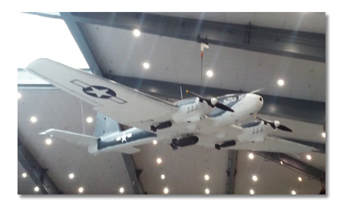
Figure 8. The only remaining TDR-1 on display at the National Museum of Naval Aviation in Pensacola, Florida.

Rear Admiral Towers, impressed with the success of the tests, suggested that as many as 100 obsolete TBD Devastator aircraft be assigned to the program, and as SB2C Helldiver and SB2D Destroyer aircraft became obsolete, that they also be assigned. He was emphatic that special assault aircraft be developed in such a manner that they could be manufactured in quantities by industries not connected with the aircraft industry so that the industry would not be further burdened with a weapon unproven in combat.<sup>4, 14, 16</sup>