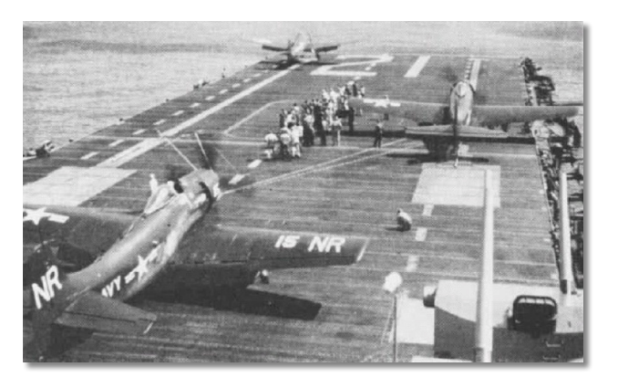
Figure 10. An F6F-5K of GMU-90 launches from USS Boxer (CV-21) off the coast of Korea.

The Cold War started immediately after WWII. America's concern was to suppress the spread of Communism by maintaining a nuclear weapons advantage and developing a significant intelligence database to support strategic planning. Manned reconnaissance