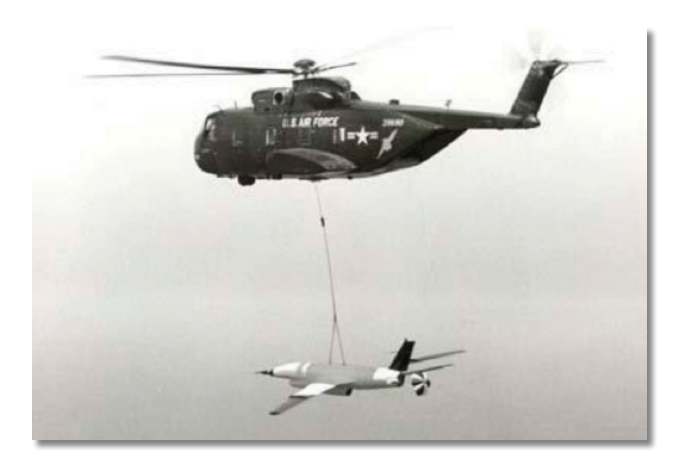
Figure 13. An H-53 helicopter performs a midair retrieval (MARS).

were later recovered on the surface of the South China Sea. In 1965, the Chinese held a news conference during which they displayed a downed U.S. pilotless reconnaissance aircraft. This was the first opportunity the American public had to observe a UAV performing missions too dangerous or politically sensitive to be undertaken by manned aircraft. UAV operations against mainland China were suspended by President Richard M. Nixon in the early 1970s as a result of improved relations between the two countries.<sup>6</sup>