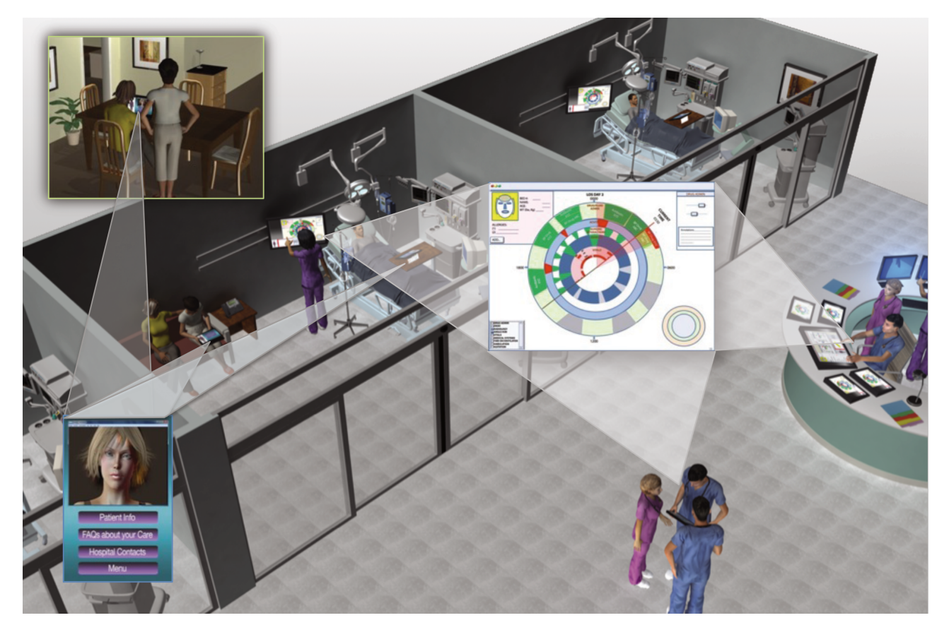
Figure 3. A notional integrated ICU concept of operations.

ences. This ICU design leverages information residing in existing information systems to pull and push the necessary information and provides a means to effectively convey the information tailored to the patient's specific needs, challenges, and situation. There are no technical barriers to enabling such a capability, and the payoff in terms of patient and family experience may be substantial.