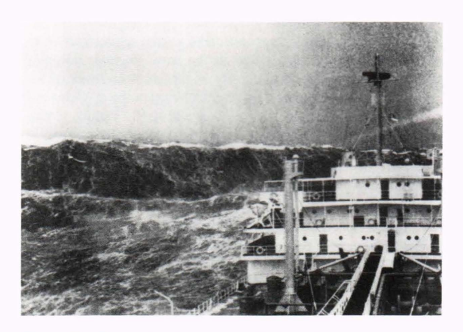
Figure 2. Example of an unusually large long-crested wave. (Reprinted with permission of the American Bureau of Shipping, Surveyor , May 1968, p. 23.)

Given a seaway that is almost invariably short-crested, how do we end up with a single, huge, long-crested wave?