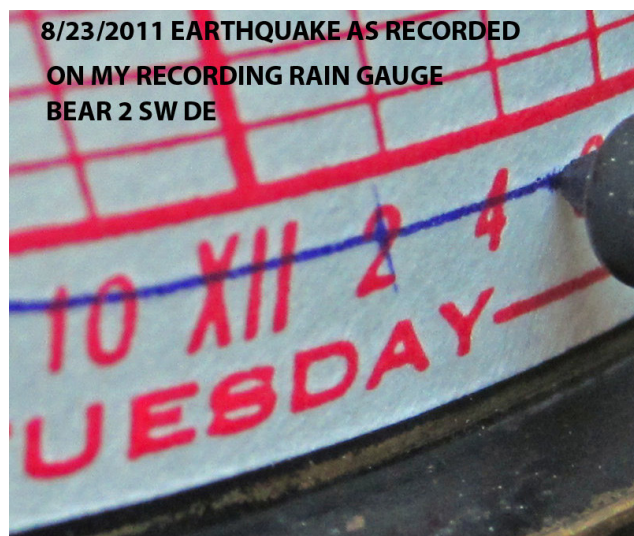
Vibration mark left of the recording rain gauge chart of Gary Gallaher, Bear 2 SW DE, on 8/23

27th & 28th - Hurricane Irene: Precipitation 0.22".