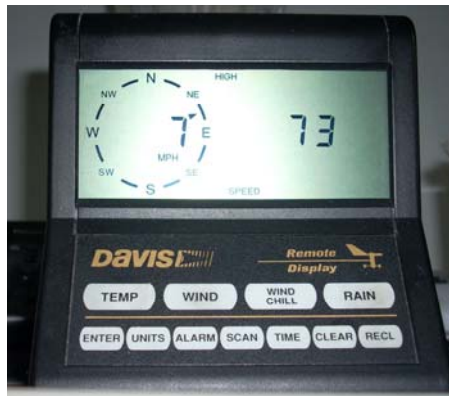
12:19 AM PWG of 73 MPH Display