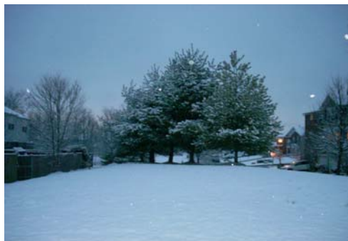
February 20 Snowfall

Daily average temperatures and precipitation based on observation times, not calendar days.