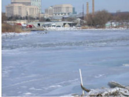
CHRISTINA RIVER LOOKING NORTHWEST TOWARDS THE WILMINGTON DE SKYLINE