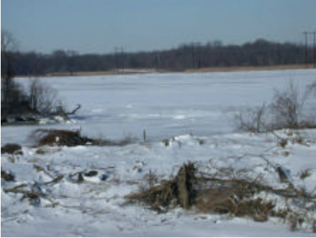
CHRISTINA RIVER AND CHURCHMANS MARSH FROM I-95 SOUTHBOUND BETWEEN EXITS 4 & 5 (CHRISTIANA MALL AND NEWPORT, DELAWARE)