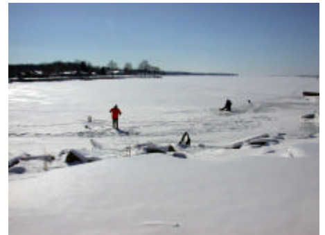
TWO ICE FISHERMAN ON THE NORTHEAST RIVER, NORTHEAST, MD. ICE 12" THICK