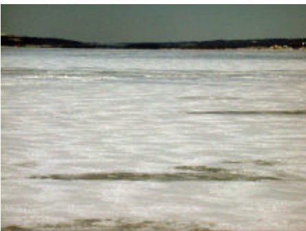
LOOKING NORTHWEST ACROSS THE FROZEN UPPER CHESAPEAKE BAY TOWARDS THE MOUTH OF THE SUSQUEHANNA RIVER FROM NEAR TURKEY POINT IN ELK NECK STATE PARK. DISTANCE ~7 MILES.