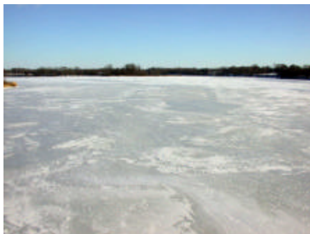
BOHEMIA RIVER FROM MD RT 213 BRIDGE LOOKING WEST CECIL COUNTY, MARYLAND