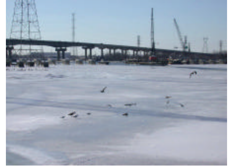
I-495 BRIDGE OVER CHRISTINA RIVER, WILMINGTON, DELAWARE..