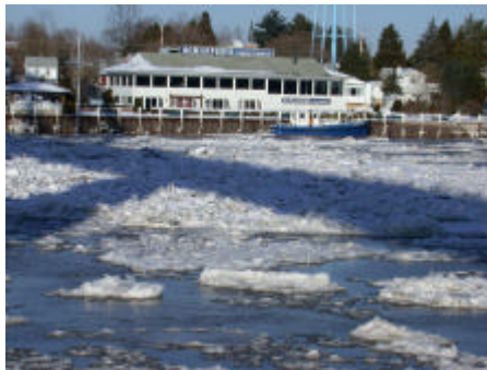
ICE FLOWS ON THE CHESAPEAKE AND DELAWARE CANAL IN CHESAPEAKE CANAL, CHESAPEAKE CITY, MD. SCHAFER CANAL HOUSE IS IN THE BACKGROUND.