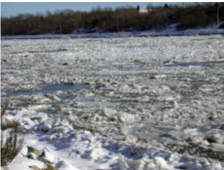
ICE FLOWS ON THE DELAWARE AND CHESAPEAKE CANAL NEAR THE DELAWARE / MARYLAND LINE