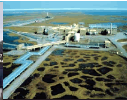
Prudhoe Bay Oil Drilling Prudhoe Bay, Alaska